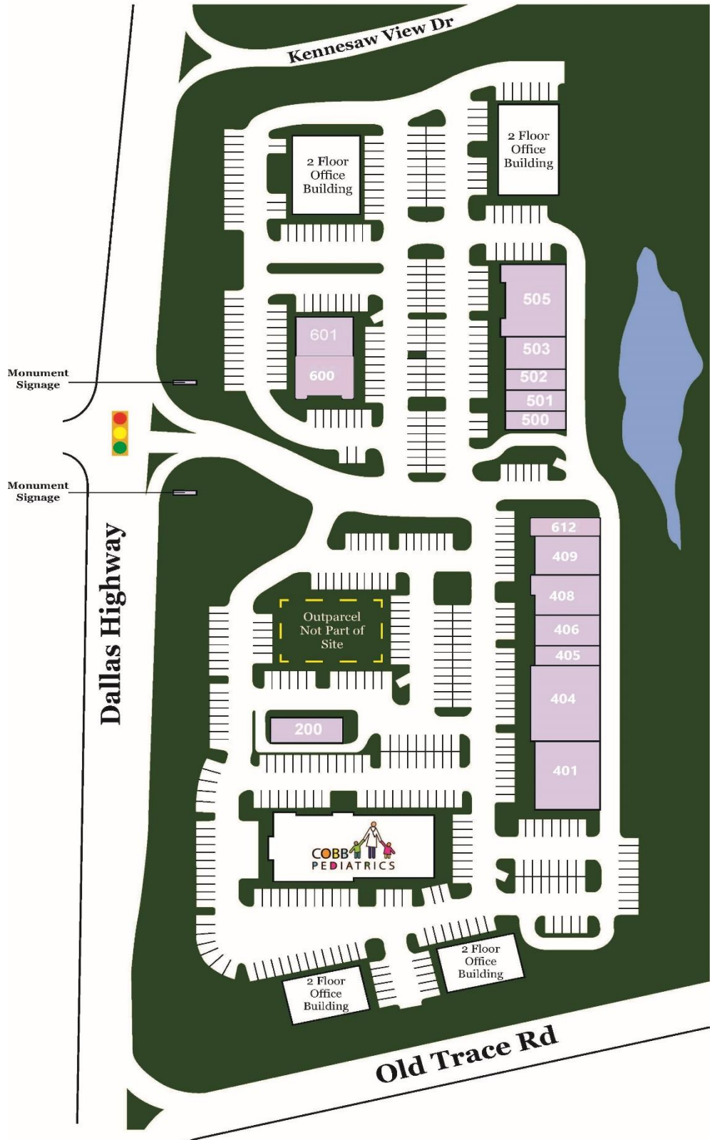
VILLAGE AT OLD TRACE Site Plan