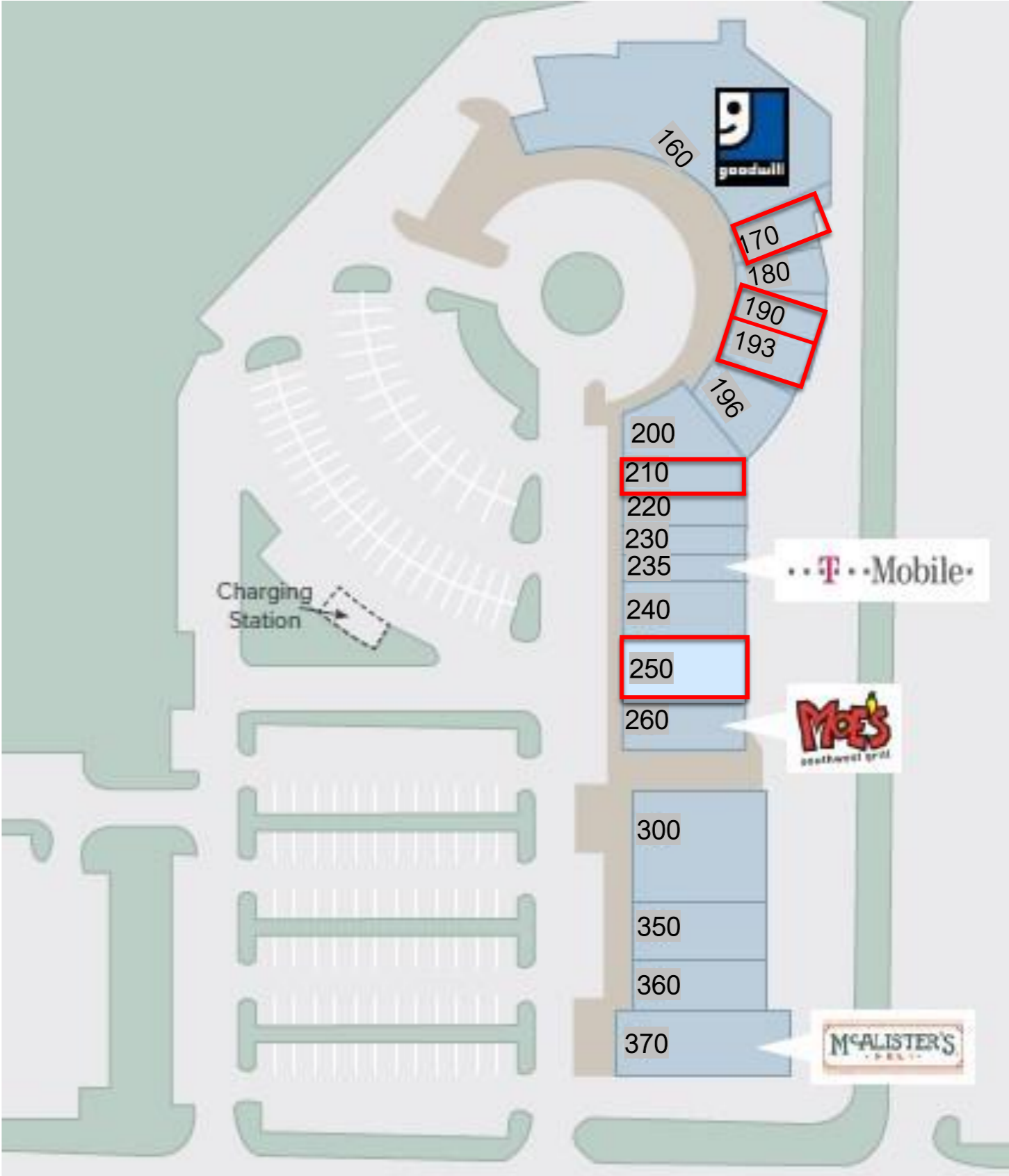
PLANTATION VILLAGE Site Plan